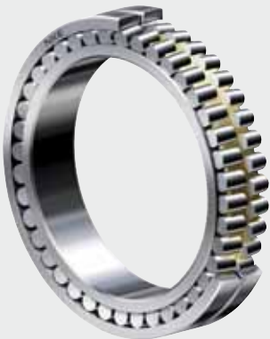
NKE spherical roller bearing