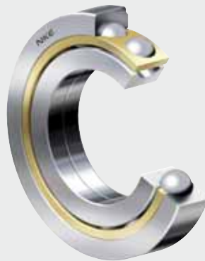
NKE four-point contact ball bearings