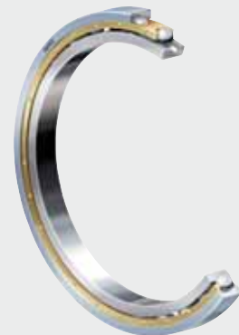
NKE deep groove ball bearings (with insulation coating on outer ring)