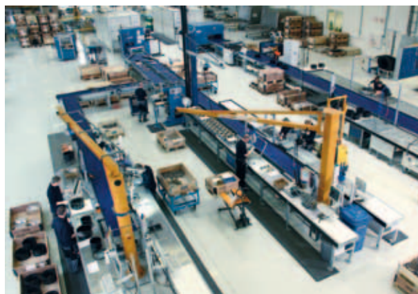
NKE's new modular component assembly enables prompt production of your ordered items.